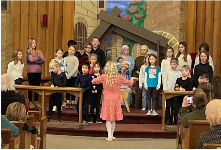
Children's Christmas Pageant - O Come Let Us Adore Him

December was a fun and full month for our children, youth and families!